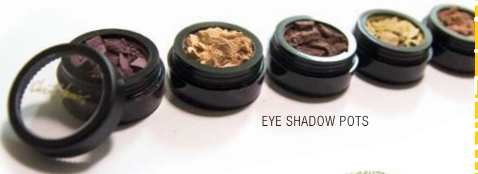
EYE SHADOW POTS