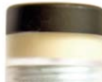
EYE LIFT HIGHLIGHTER