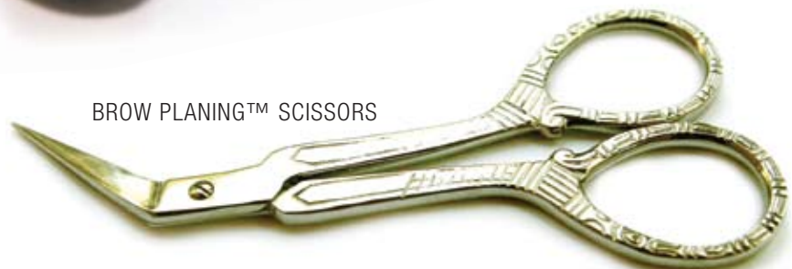
BROW PLANING™ SCISSORS