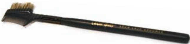
BROW LASH GROOMER